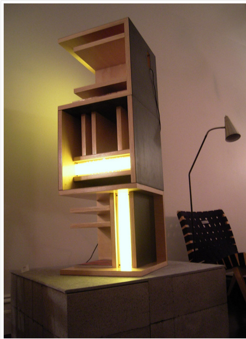
Mick's 'Cube' modular storage - again available at Tongue and Groove

My inspiration for product design probably comes from the material thing I learnt at Six Degrees. The products I've designed have more to do with learning about the qualities of a material than creating a nice looking object. Often, I find an interesting material and think "what could I design with this?" The object is more an outcome of the properties inherent in the material than it's use. It's probably why I don't sell that much stuff! Product design is also a lot more immediate than architecture – best of all objects don't require a planning permit.